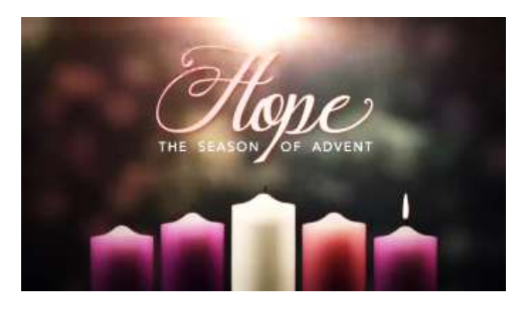
Message "What If I Missed It?"

8:30am & 10:30am Services visit www.rumcoh.org